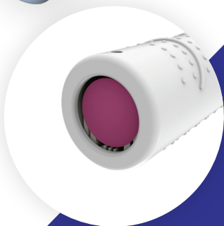
Firing Switch at the bottom

Designed for clear visibility to precisely reach and collect optimal, high quality core sample needed for an effective pathological examination.